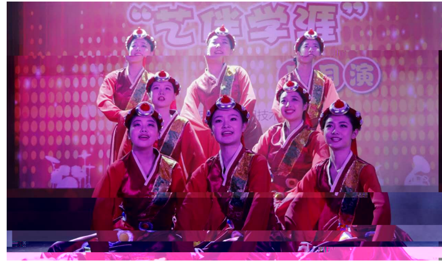
4 17 63

HI @ i ( R HI G @ i a < 4 3 / 4 ( AEUH l @ i ( R Q [ v 5 ( 3 @ i < = M J = c # . G @ i @ / # @ / # / J : / O / > x q # 5 x ? @ HI G ! / O q 4 @ i @ / 9 BA " U e 4 5 HI ~ G d M S R = B P 2 ( gh # + A P 1 [ 4 + Cz X 1 G ~ G DE # O PO & F X O 4 HI B @ i G % & U